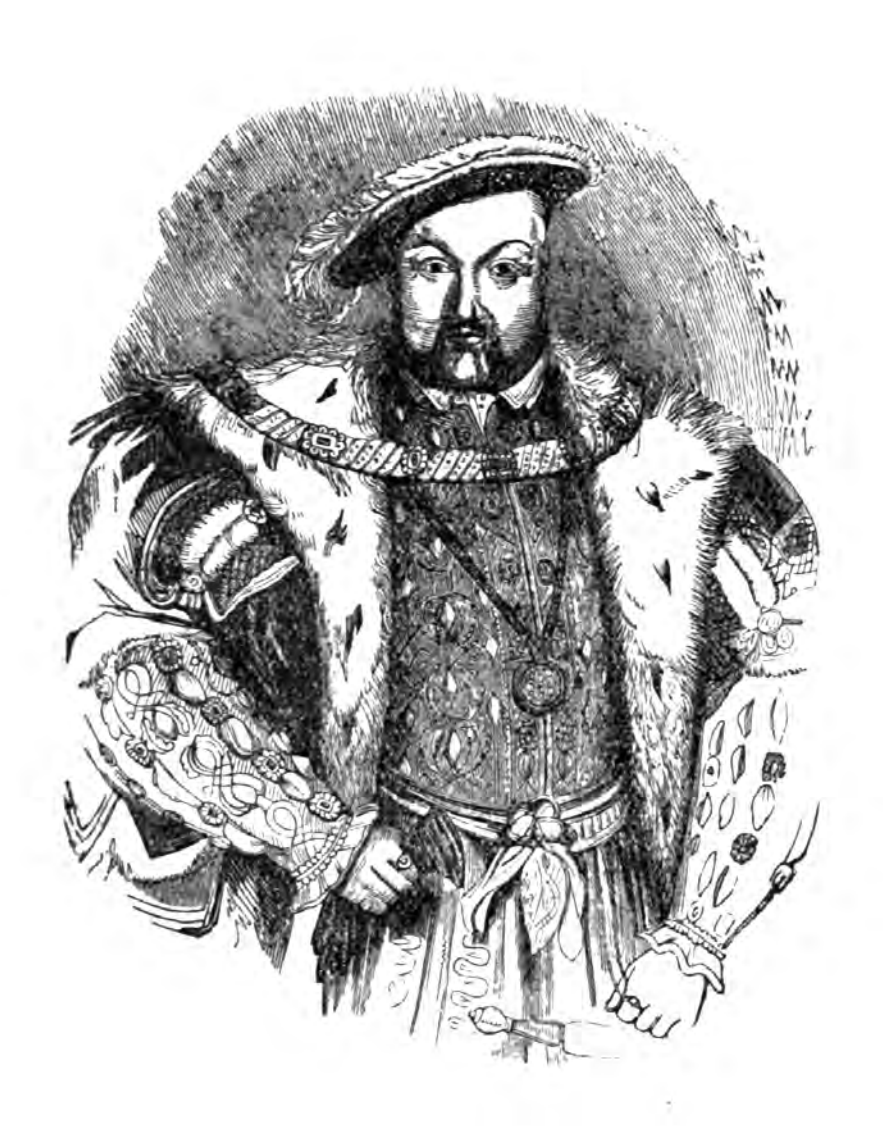
PORTRAIT OF HENRY VIII